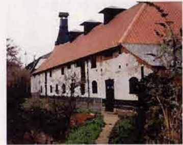
Former Stowmarket Maltings