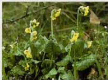
Oxlips at Combs Wood

Combs Wood is an excellent example of an 'Ancient Woodland'. The earliest record of this wood is in the Domesday Book (1086). In