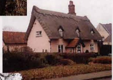
Cottage in Combs