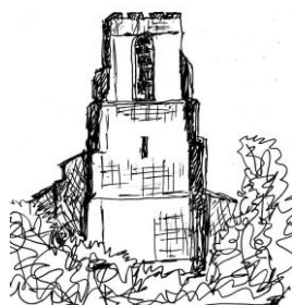
St Mary's, Combs

Follow the path to the left between fields and head back into Combs village – more of the spire of Great Finborough church should now be visible just off to the right. Notice the Charcoal and Churches plaque on the fence as you pass the menagerie at Holyoak Farm. Details of the Charcoal and Churches walk in the Walks section of the Combs Village website.