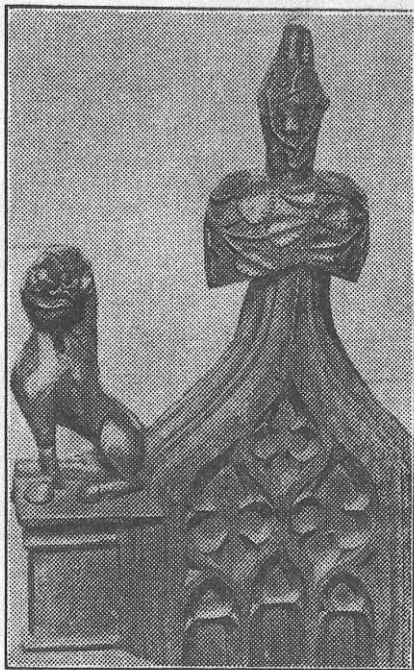
A CARVED PEW-END.

covered the whole, extending behind the communion table and as far as the chancel door on the north side. This splendid piece of work was restored by competent workmen, every piece of the ancient stone being utilised. A niche in the south side of the east window was also revealed on the removal of disfiguring brickwork and plaster; this was also restored, and a niche to correspond placed on the opposite side: in these were placed the Ten Commandments. A doorway leading to the rood loft was discovered when dealing with the Dandy vault. At the west end of the south aisle an ugly brick vault has been built above the floor level, in which were nine coffins of