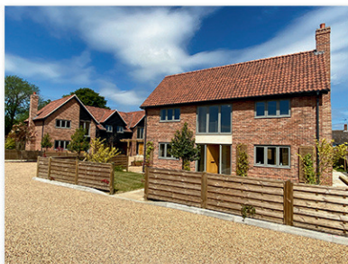
New Build Developments