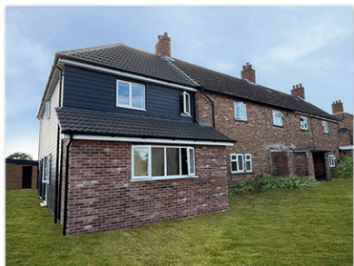
Extensions & Alterations

office@letsdesignarchitecture.com Architectural Design and Consultancy